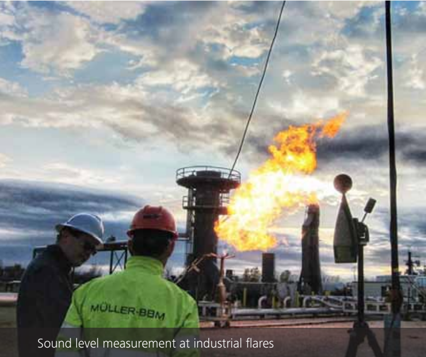
Sound level measurement at industrial flares

For more than 50 years, Müller-BBM has been working in the fields of noise and vibration control in industry with an interdisciplinary approach. Based on specific know-how and comprehensive experience, Müller-BBM engineers are familiar with operating procedures and process engineering. Thus, we know what matters and will find economic solutions in close cooperation with the plant operator for a convenient practical implementation.