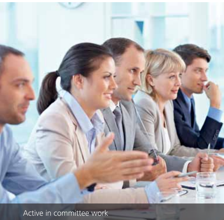
Active in committee work

Our long-term experienced experts impart their knowledge and train engineers, technicians and health and safety officers on everything they need to know about acoustics, industrial acoustics and noise control in order to prepare offers and operate industrial plants safely and legally compliant.