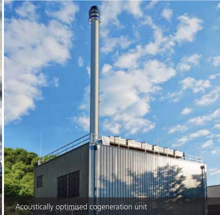
Acoustically optimised cogeneration unit

A consistent overall concept in sound and vibration control provides various advantages for investors and operators of industrial plants: