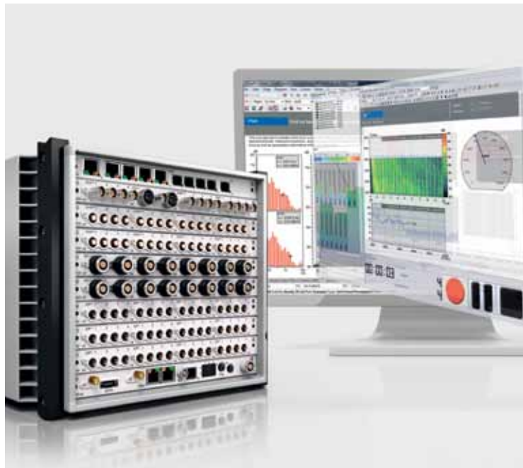
Multichannel measurement system PAK®

Müller-BBM carries out measurements and calculations impartially and independently. For this purpose, state-of-the-art measuring instruments and software tools are at our disposal. The number and combination of our test stands for measuring and analysing noise and vibration and for testing of technical solutions is presumably unique.