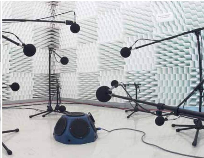
Measurement in the hemi-anechoic room