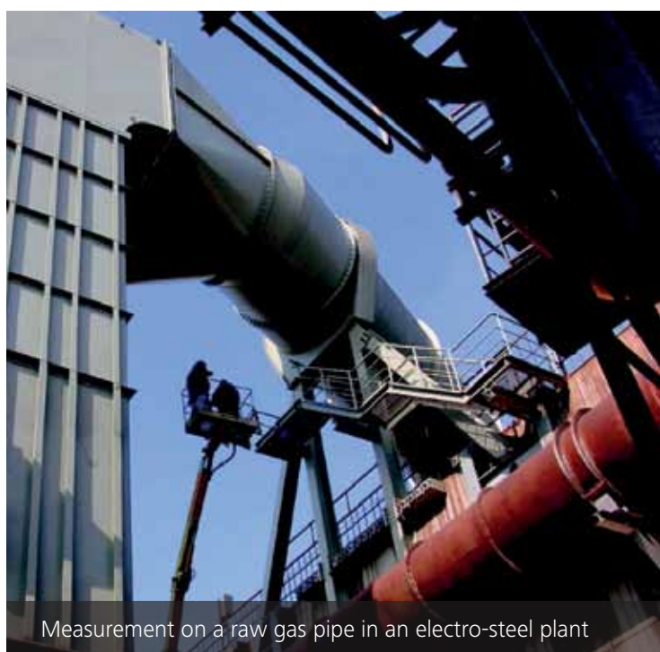
Measurement on a raw gas pipe in an electro-steel plant

Müller-BBM elaborates, specifies and coordinates all necessary measures for the acoustic optimisation and the efficient, safe and environmentally friendly operation of industrial plants and workplaces. In doing so, we always have an eye for the legal requirements that are relevant for the planning, approval, construction, acceptance and operation of technical installations.