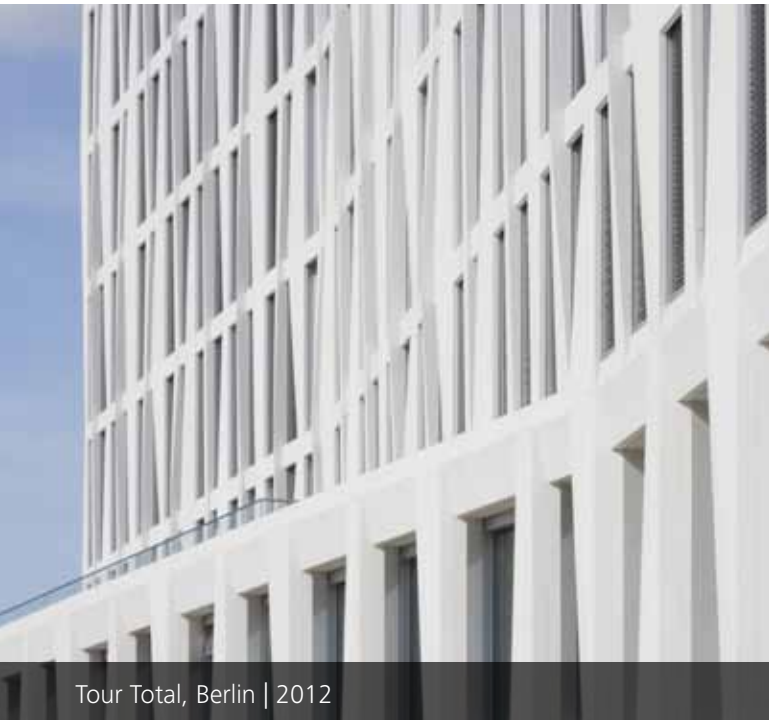
Tour Total, Berlin | 2012