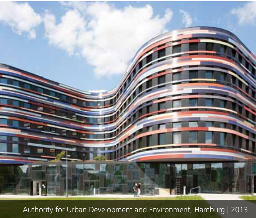
Authority for Urban Development and Environment, Hamburg | 2013

We improve the acoustics, the functionality and sustainability of your rooms and buildings with an unwavering eye on the ecological and economic aspects as well as the current standards and guidelines. Whether an architect, developer, investor, public or private client, you benefit from individual consultation, networked performance profiles and integrated solutions that are holistic, targeted and future-oriented. From feasibility studies to detailed design, from supervision of construction right up to commissioning, we focus on the safety, quality and success of your project, always in accordance with your time-line, and without losing sight of the architectural concept.