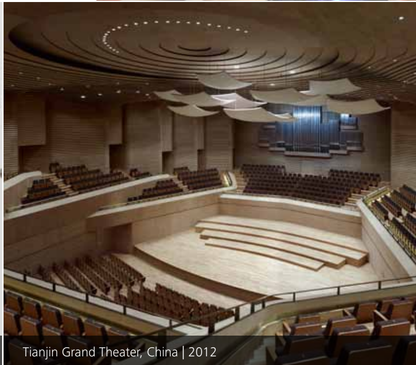
Tianjin Grand Theater, China | 2012

using multi-dimensional and transient simulations to minimize heat loss and to prevent moisture damage.