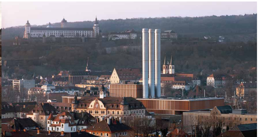
Power Plant Würzburg – examined by Müller-BBM